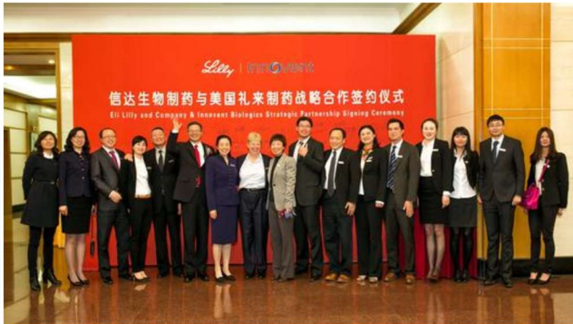
CELEBRATING ONE OF THE BIGGEST DEALS EVER DONE IN CHINA

Aeromics & Sincere Announce Collaboration